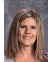
General Music Teacher

PreK-4th Grade - Everyone loves a good story! The elementary students have been discovering how some of the best musical storytellers can bring a story to life through the use of melody, harmony, dynamics and tempo. In the process we learned about the four instrument families: Strings, Woodwinds, Brass and Percussion. The PreK & 1st-3rd graders explored the exciting story of " Peter & the Wolf " by Peter Tchaikovsky. The Kindergarten classes heard the Minnesota Orchestra Notes Alive Story Concert version of " Dr. Suess's My Many Colored Days ." The 4th graders learned the story of the famous composer Ludwig van Beethoven and are learning to sing and play his famous melody " Ode to Joy ."