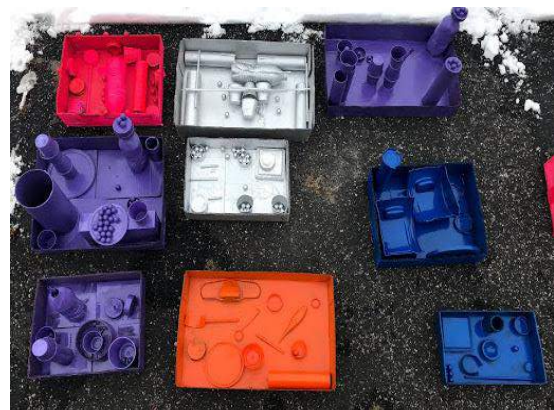
2nd grade Louise Nevelson Sculptures

In the engineering unit, the students have been experimenting with hands on activities to practice critical thinking and problem solving. The past three weeks, the students have built structures using various materials with the challenge of supporting various amounts of weights. This unit will continue as we learn about bridges and why it is important to create a structure correctly to ensure safety.