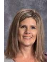
PreK - 6th Grade Music teacher

April 11: 5th-6th Spring Program 7:00 p.m. in the Meadow Creek Church Worship Center