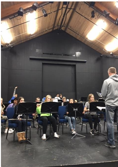
Festival Band warming up Tuesday morning before Thanksgiving break!

As we start the next trimester, we have a new group of students starting the Music Tech class. At the beginning stages we are recording some simple phrases and then manipulating the effects to change the sound of the voice. Students then are submitting the project to me, via Google Docs or by e-mail. They are to "bounce" down the recording as an mp3, or mp4 and then submit it to me for evaluation. This will be the process for future projects as well.