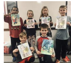
2 nd Grade students displaying coloring sheets from Peter & the Wolf

PreK-4th Grade - Everyone loves a good story! The elementary students have been discovering how some of the best musical storytellers can bring a story to life through the use of melody, harmony, dynamics, and tempo. In the process, we learned about the four instrument families: Strings, Woodwinds, Brass and Percussion. PreK, 1 st , 2 nd & 3 rd grade explored the exciting story of " Peter & the Wolf " by Peter Tchaikovsky and our Kindergarten heard the Minnesota Orchestra Notes Alive Story Concert version of " Dr. Suess's My Many Colored Days ." The 4th grade students learned the story of the famous composer; Ludwig van Beethoven and is learning to sing and play his famous melody " Ode to Joy ."