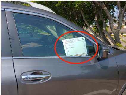
CAR PICK UP SIGN